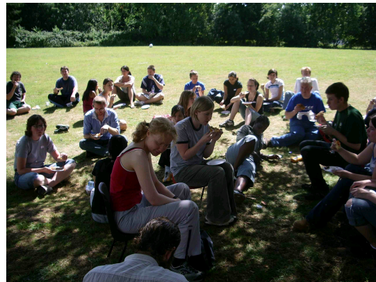
Above- Volunteers enjoy pizza at lunch break.