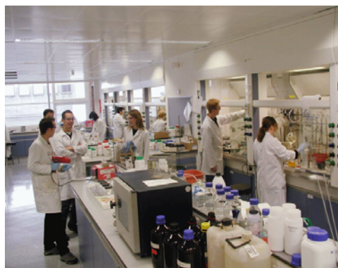
Lively banter in the labs!

The biggest change in the group is, of course, our location, which occurred over two years ago. So, no more freezing labs in the winter, sweltering heat in the summer, smelly and unkempt laboratories with bits of plaster falling off the ceiling, as we are now located in a very modern, air-conditioned building comprising laboratories with state-of-the-art fume cupboards.