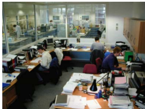
"Clean and tidy" write-up areas

special atmosphere that was prevalent at Sheffield.