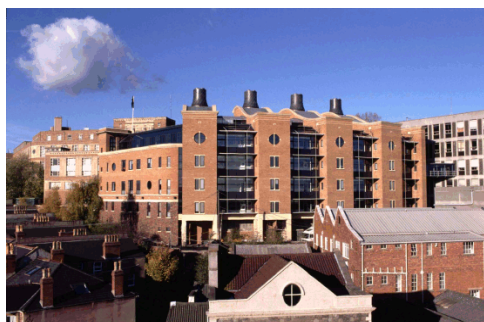
The new Chemistry building at Bristol

The biggest change in the group is, of course, our location, which occurred over two years ago. So, no more freezing labs in the winter, sweltering heat in the summer, smelly and unkempt laboratories with bits of plaster falling off the ceiling, as we are now located in a very modern, air-conditioned building comprising laboratories with state-of-the-art fume cupboards.