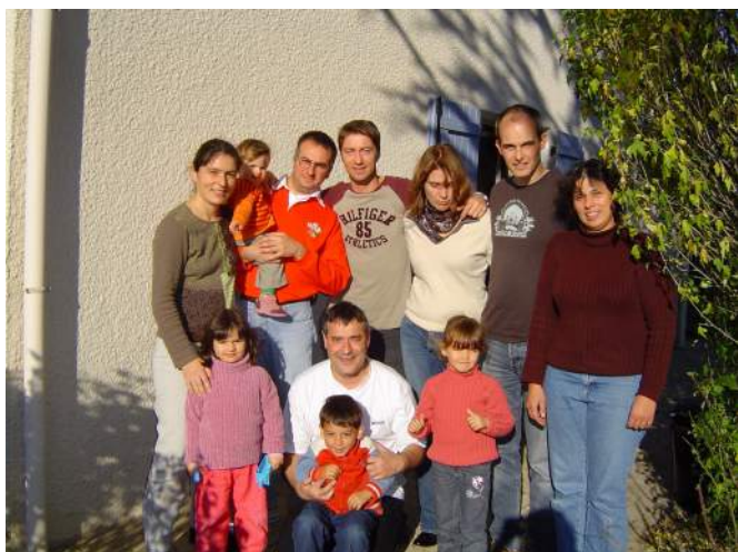
The French contingent in Lyon